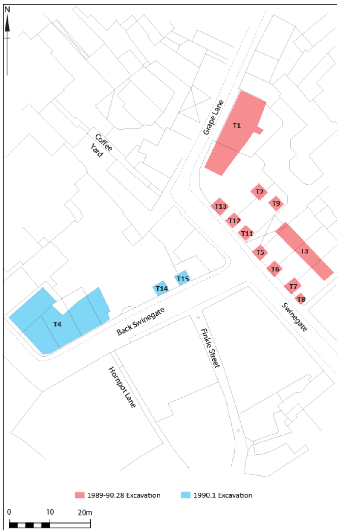
Figure 2: Trench Location