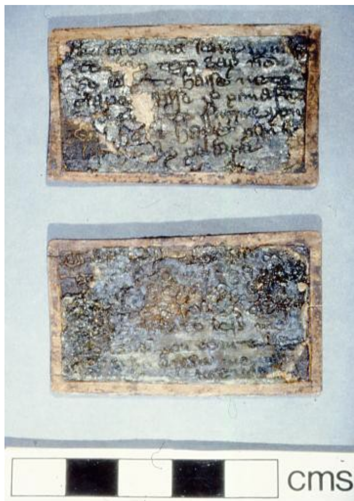
Plate 1: Swinegate wooden tablets

This report relates to two of York Archaeological Trust's excavations, the first at 12–18 Swinegate and the second at 14 Little Stonegate and 18 Back Swinegate (Figure 1). These excavations represent two of the most interesting, though little known, of the Trust's excavations. A total of fifteen trenches were excavated (Figure 2), and these revealed a complex sequence of deposits dating from Roman times to the present day. In addition, a number of exceptional artefacts were recovered including a collection of well-preserved wooden coffins of late 9th- to early 11th-century date, and a group of writing tablets of mid-14th-century date.